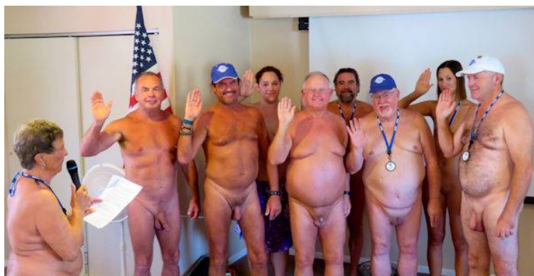
Photos of Regional convention held at De Anza Springs Nudist Park, Jacumba, California July 28-30, 2017. Right: Swearing in of officers and new members of the Board of Directors.