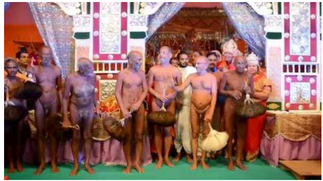
Skyclad Jain monks